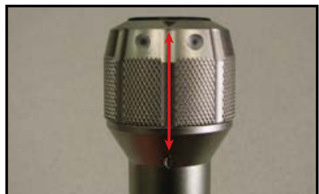
Figure 4: Alignment