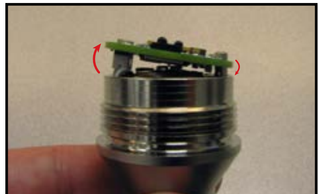
Figure 3: Skewed Circuit Board on Post