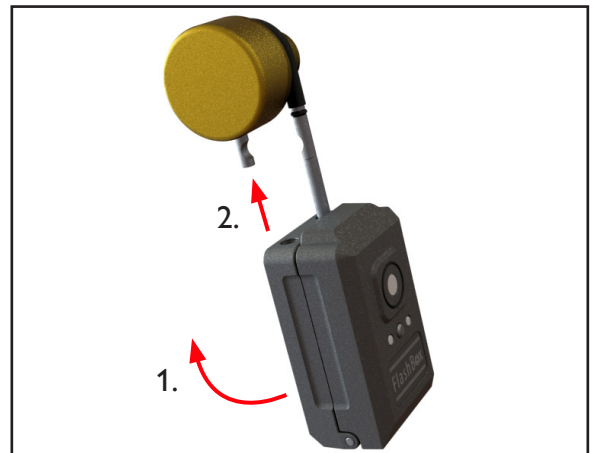
Figure 2: Install Over Knob, Close Shackle