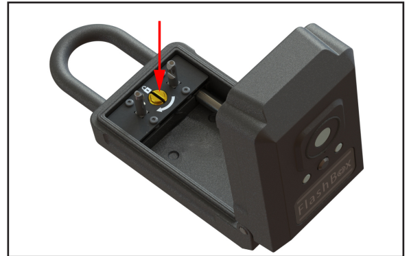
Figure 1: Release Shackle

IMPORTANT: Hands and fingers can be pinched by the lid if it is left open when closing the shackle.