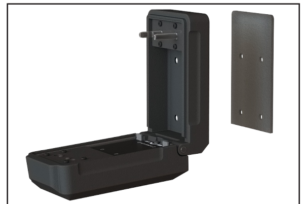
Figure 2: Wall Gasket