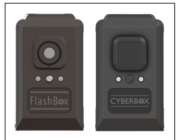
Figure 3: Installation Complete